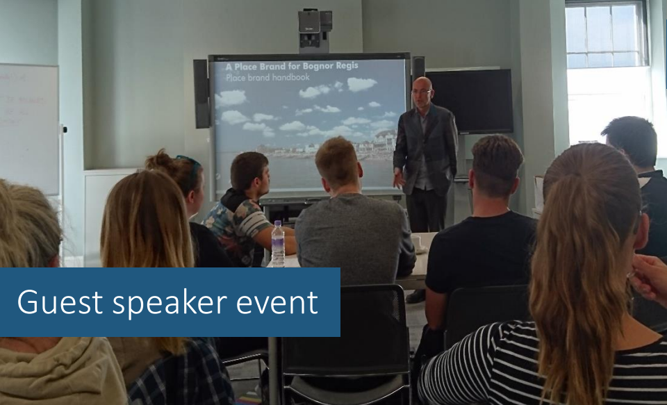
Guest speaker event